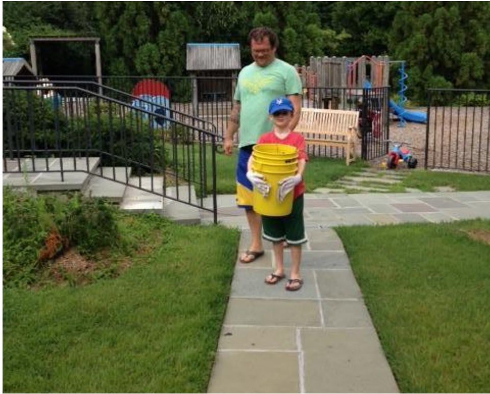
St. John's Little Learners basement upgrades!