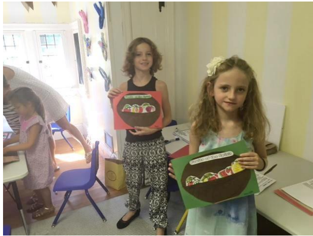
Our own "Fruits of the Holy Spirit" craft to share with our family!