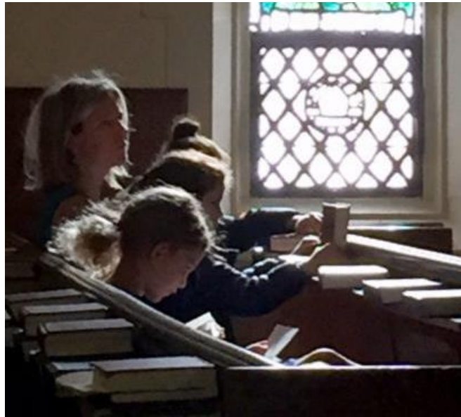
The Fredericks at Sunday services