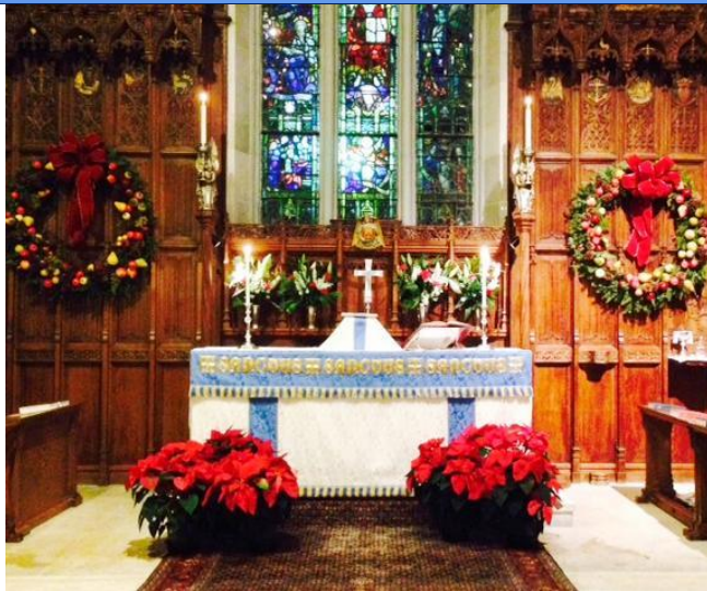
Christmas Altar 2015