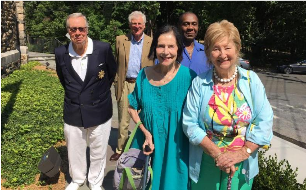
The smiles of our wonderful parishioners!