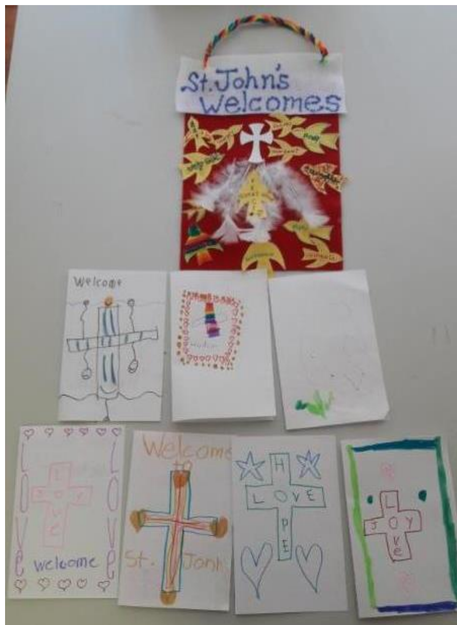
The "Children's Welcoming Ministry" created a beautiful banner and cards for the newest member of St. John's -Hudson (Baptized on August 28th).