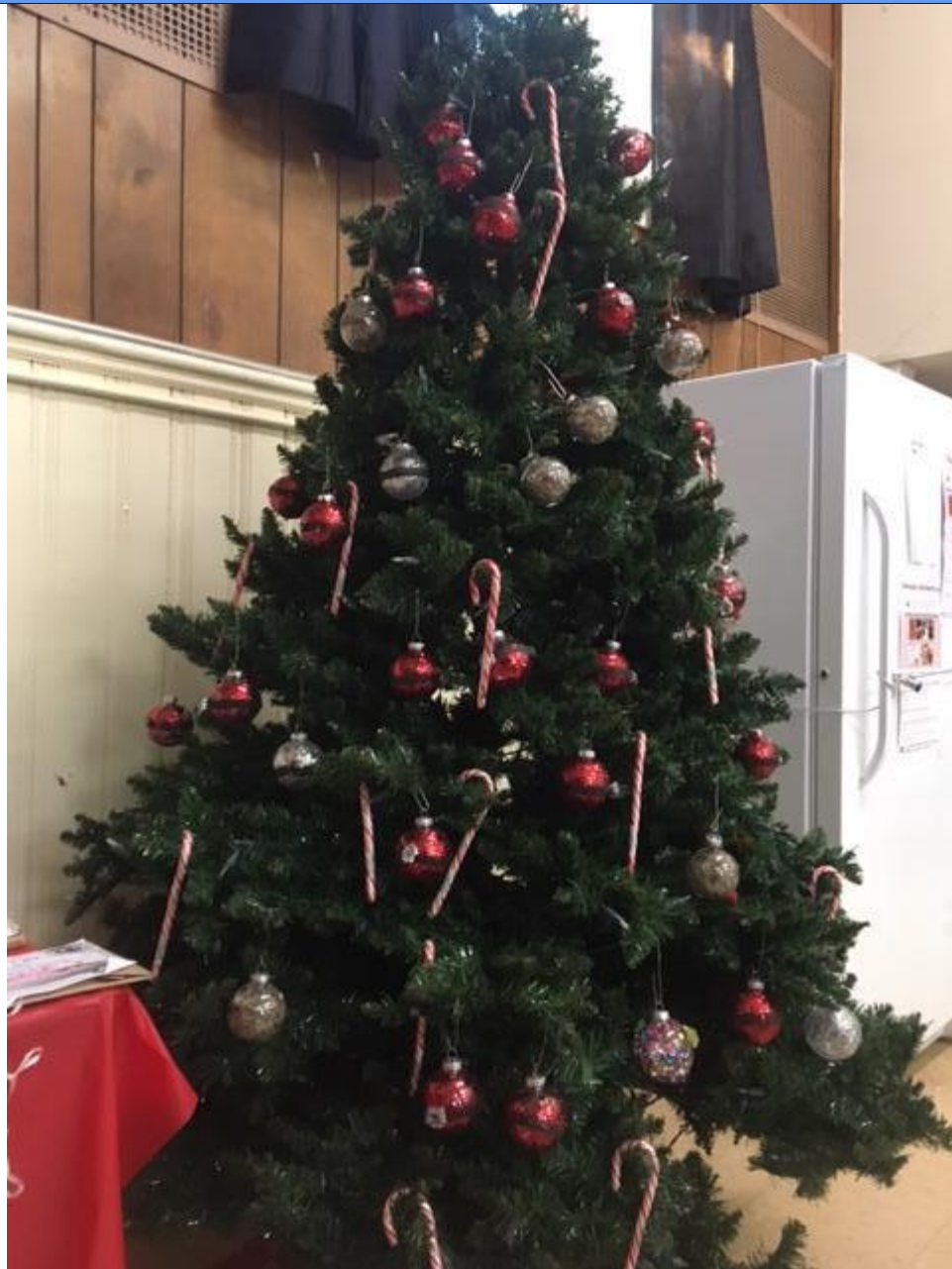
A tree was donated to the Men's Shelter in Glen Cove by St. John's Outreach...