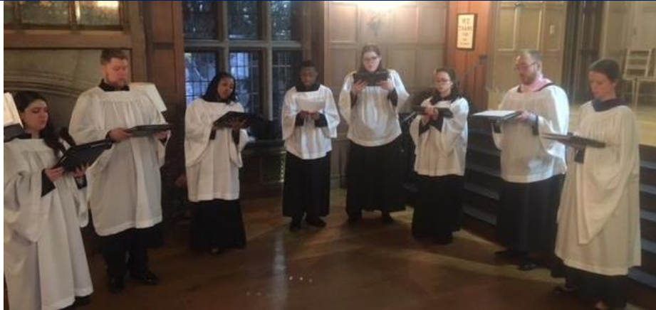
A lovely Evensong!