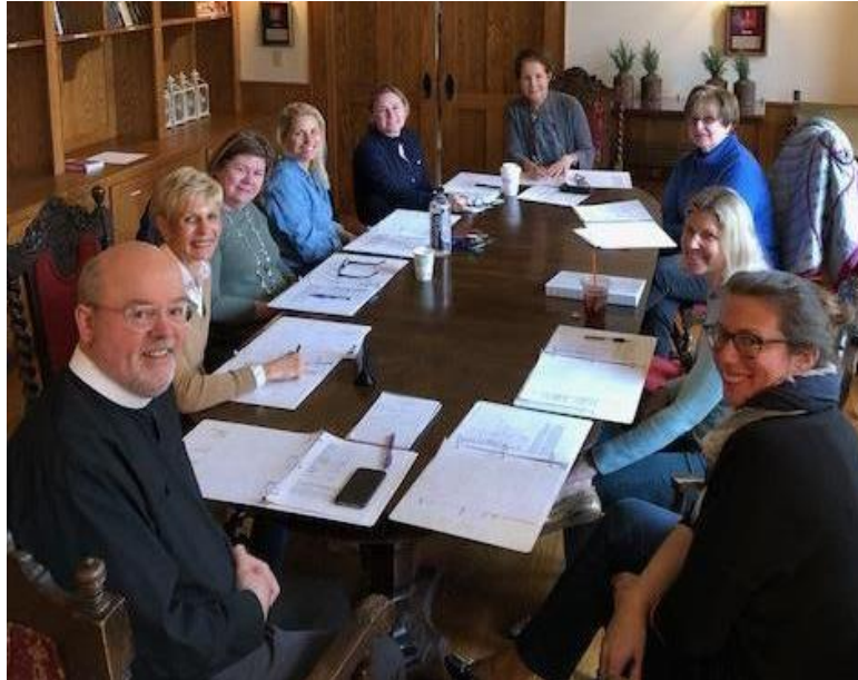
Outreach Steering Committee Meeting