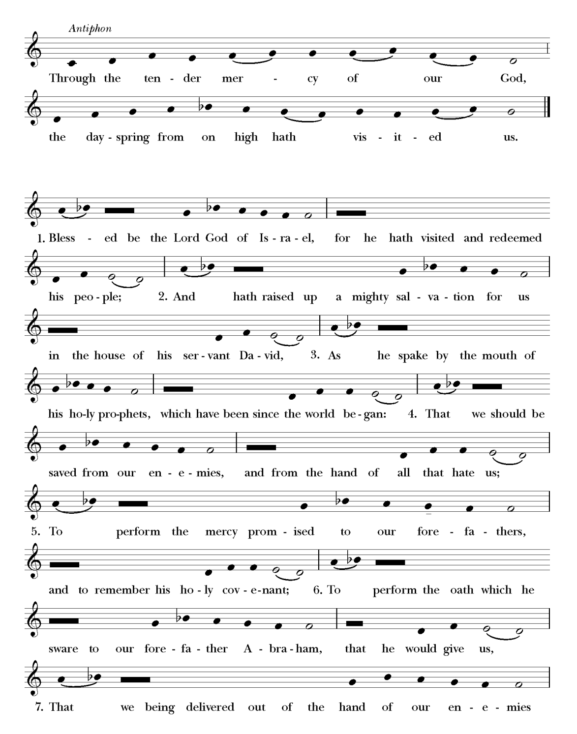
CANTICLE 4: The Song of Zechariah, p. 50 - 51 Beneduictus Dominus Deus (said by all in unison) Luke 1:68-79