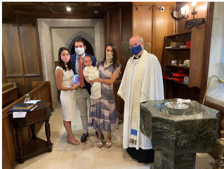
The Wagner and Sullivan families celebrate the baptism of