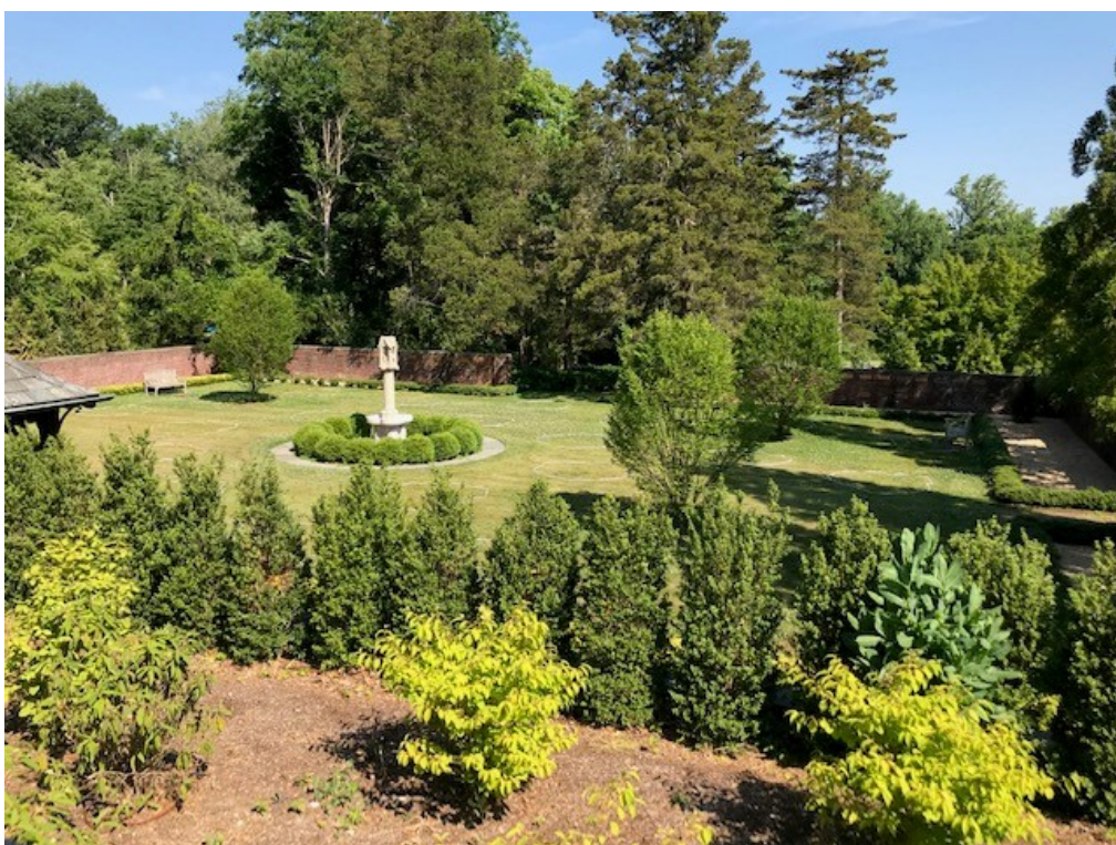
Our beautiful Memorial Garden