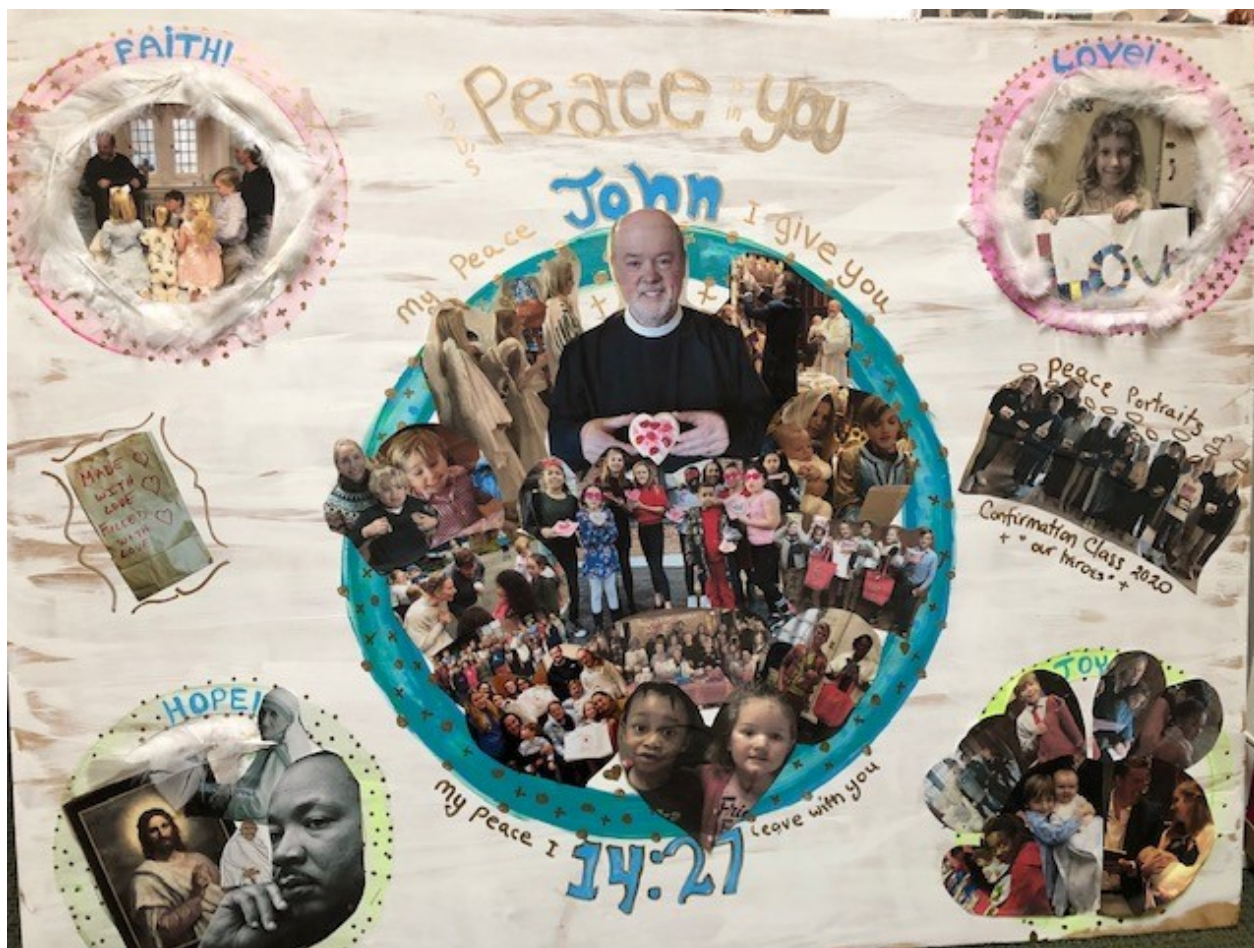
Courtney's Peace Poster- see "Craft with Miss Courtney" at our google classroom or on facebook